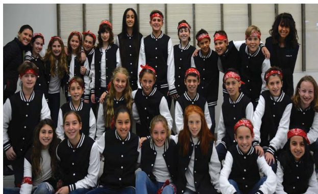
VBSDS 6th Grade Class at Generations' Day.