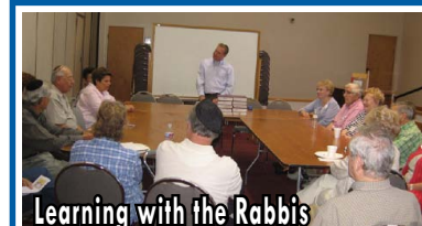
Learning with the Rabbis